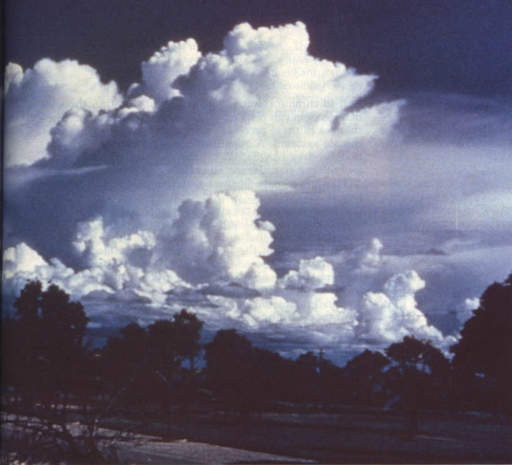
Tropical clouds in the Caribbean. Clouds not only create spectacular visual displays but also play an important role in determining Earth's climate. They may also be a major factor in determining how the climate responds to human influence. Figure 1

heat of evaporation from the surface into the atmosphere (see figure 3). N(A) is the net radiative flux in the atmosphere: